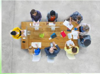
I-5, Annual Review of IEP Goals